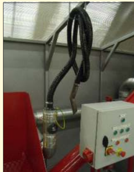
Hand-held Dust Collection Vacuum