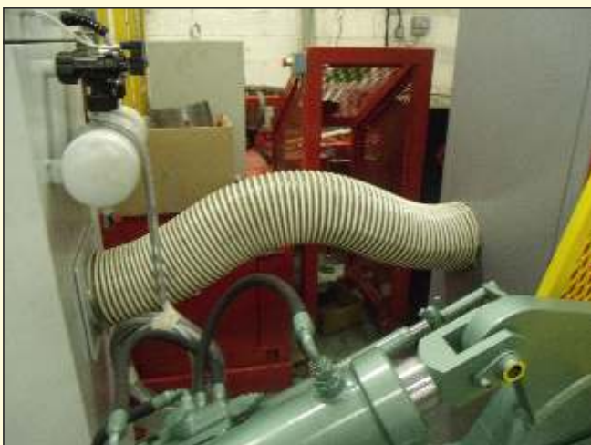
Flexible connector between extractor unit & extraction ducting.