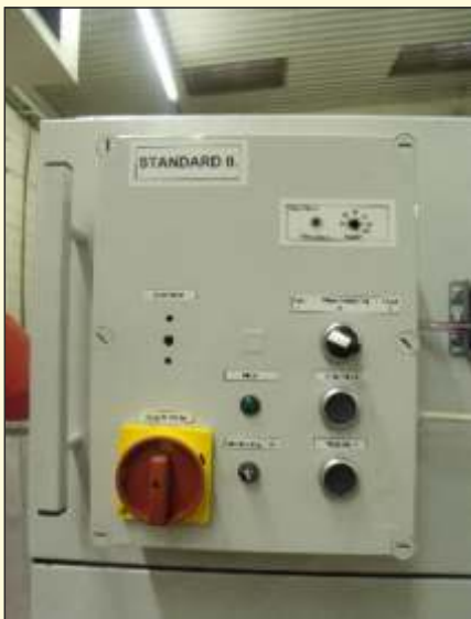
Extractor Unit Control Panel