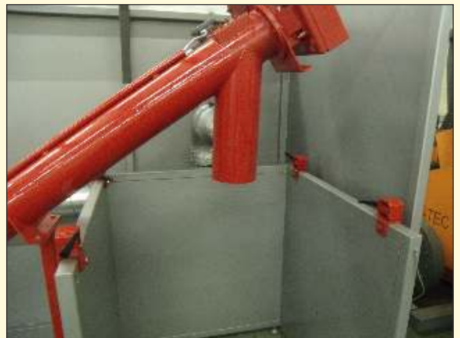
Screw Conveyor & Exit Shute