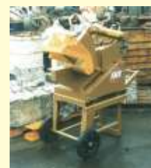
200 8" shear