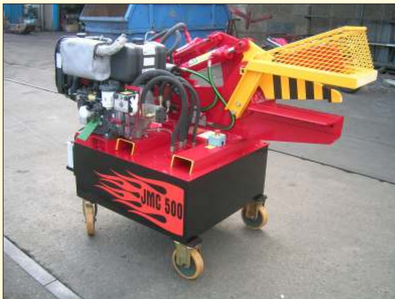
500 Shear with Diesel Engine

The JMC 500 is available with either electric motor or diesel engine.