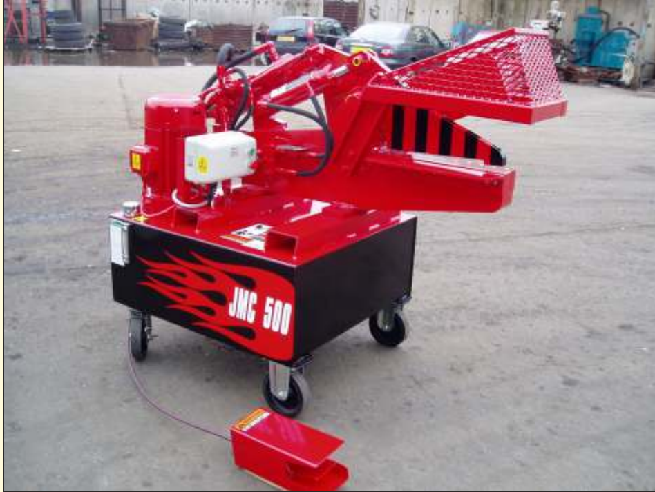
500 Shear with Electric Motor

This new-generation shear is faster and more powerful than any other machine in its field and features automatic hold down and a 500mm blade.