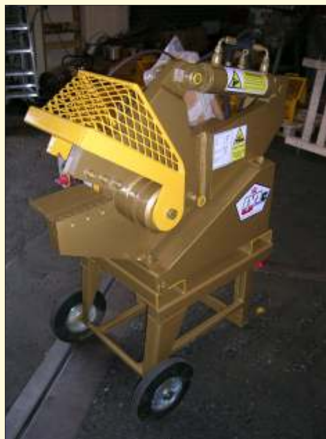
200B Shear with Wheeled stand option

The small shear with a BIG cutting capacity